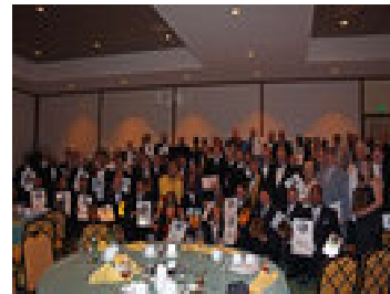
Awardees from all over the world pose for pictures after the event