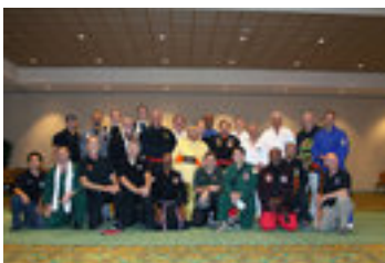
Seminar leaders pose for picture