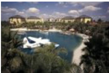
Loews Royal Pacific Resort Orlando, Florida

This was one of our classiest events yet! The venue was reminiscent of a beautiful tropical Island hide-a-way located in Orlando, Florida's famed Universal Studios. The seminars were awesome, the Island buffet fantastic; and the attendees representative of the best of the best from around the world