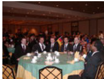
A full house of attendees at awards dinner