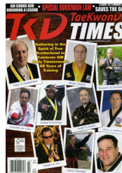
TaeKwonDo Times Magazine