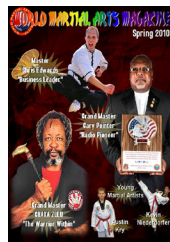
World Martial Arts Magazine